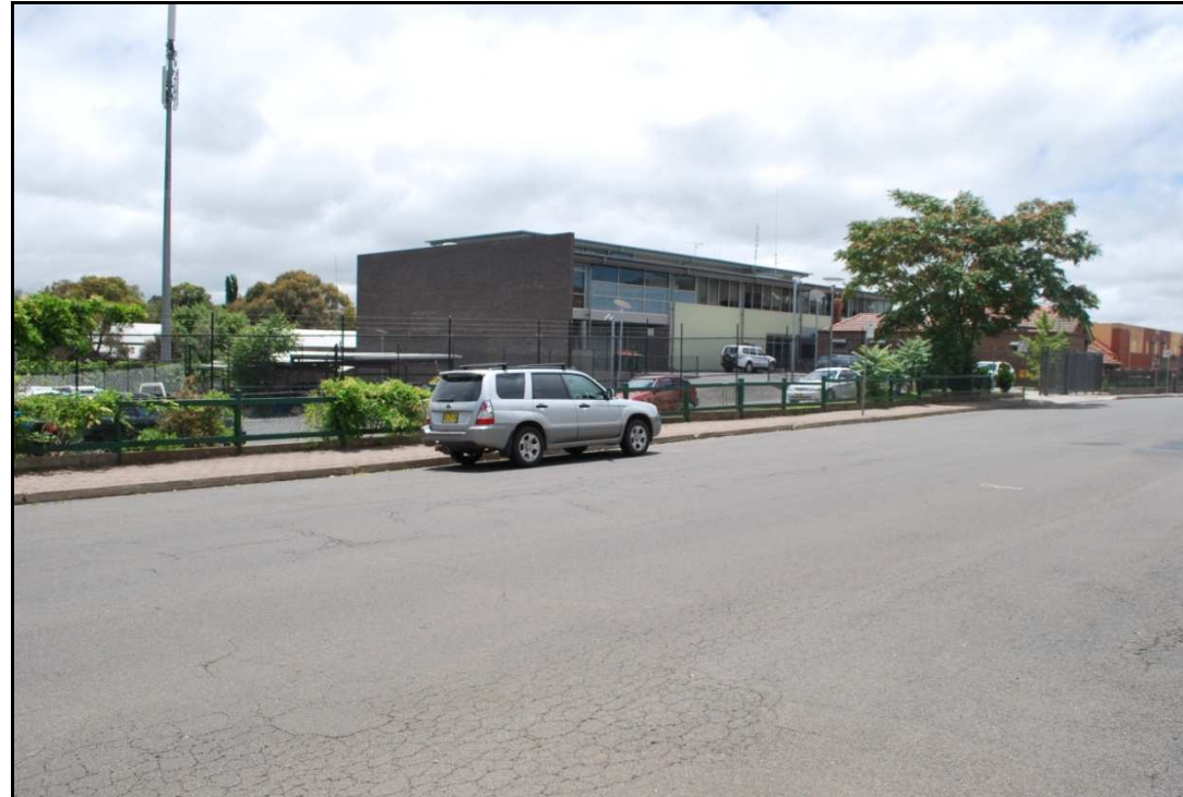
Photograph 1 – looking north-east across the subject site from Moore Street, with the Police Station immediately to the east (right). The mobile phone tower within the Telstra depot to the north of the site is visible to the left of the photograph.