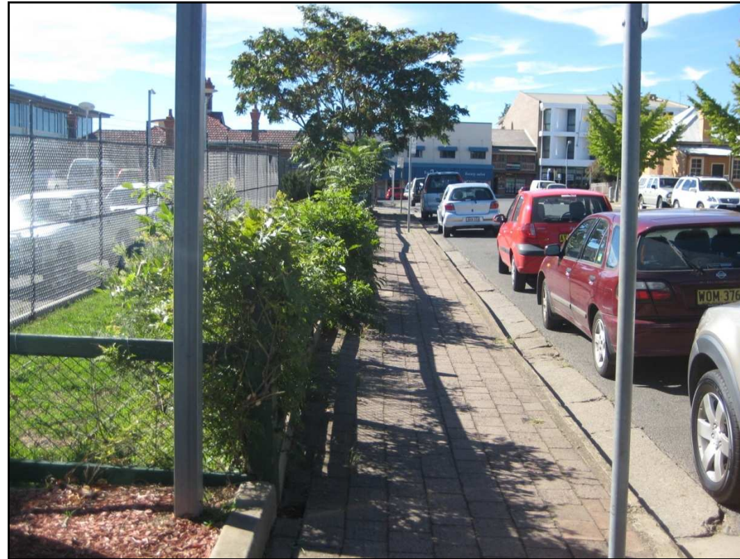
Photograph 3 – looking east along the Moore Street frontage of the site.