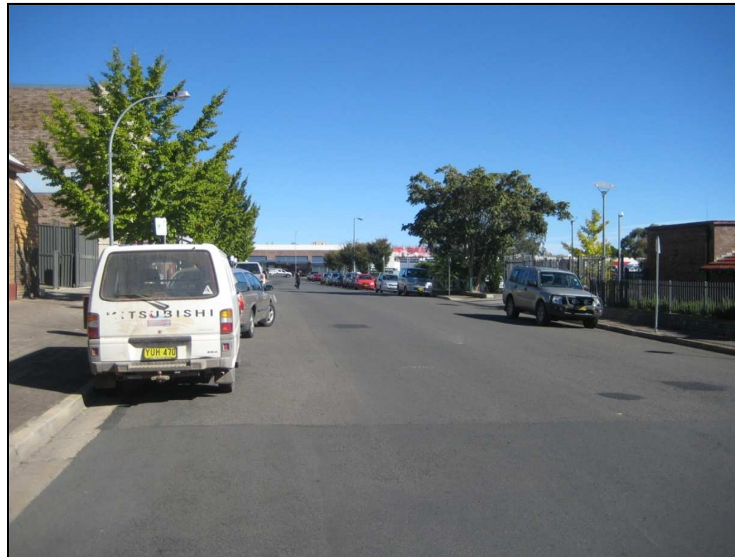
Photograph 6 – looking west down Moore Street past the frontage of the former Police Station (on the right) and the subject site further along.