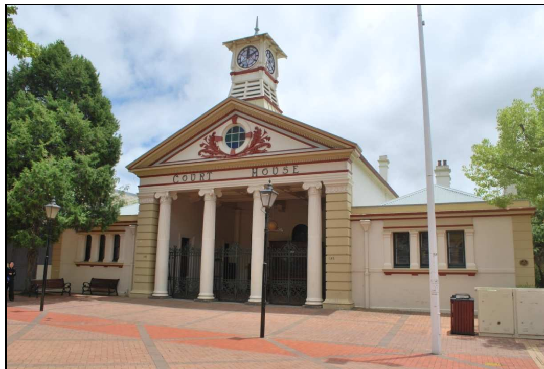
Photograph 7 – The existing Armidale Courthouse in the Beardy Street Mall.