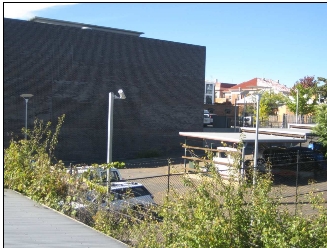
Photograph 5 – looking south-east across the subject site at the wall of the new Police Station from the upper deck of the public car park to the west of the site. The existing car port is visible to the right of the photograph.