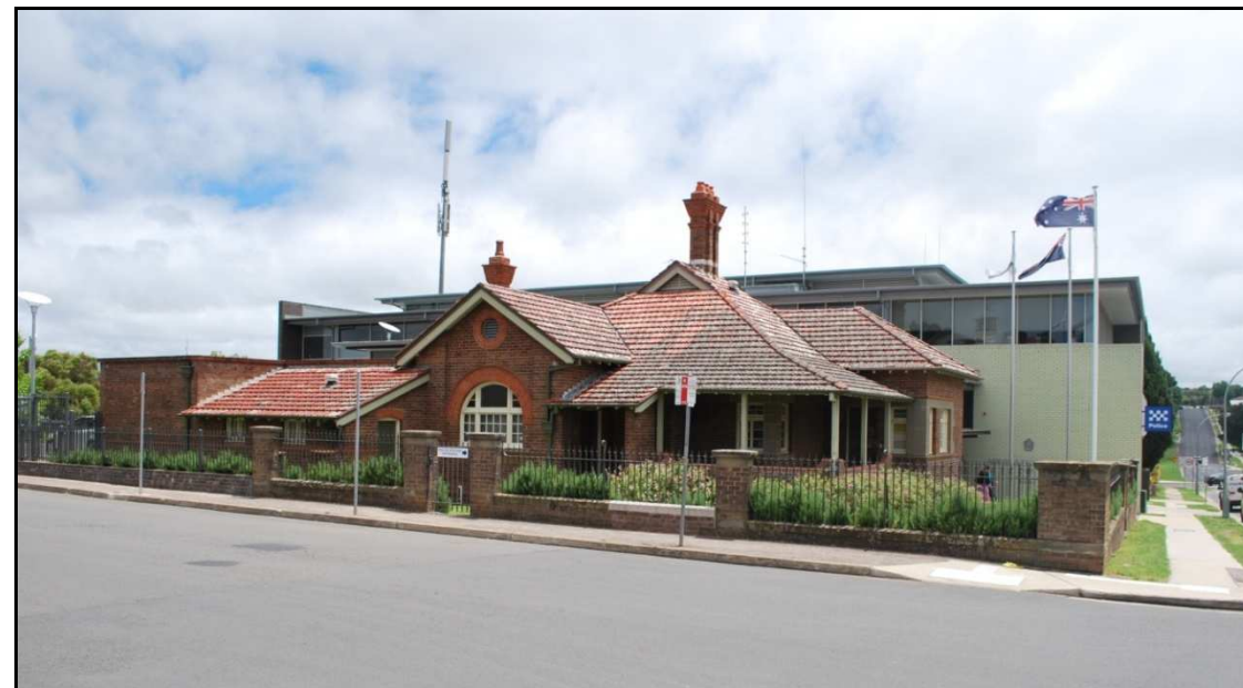
Photograph 4 – Looking north from Moore Street at the original (heritage listed) Police Station, with the new (2006) Police Station to the rear. Faulkner Street is to the right.