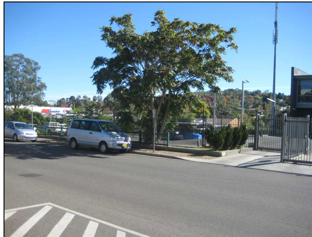
Photograph 2 – looking north-west across the subject site from Moore Street. The security gate access to the site through lot 6 is seen at the right of the photograph.